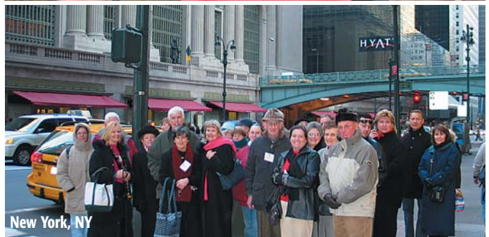
New York, NY